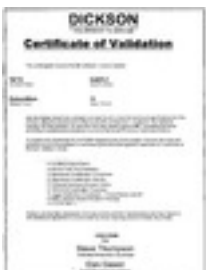
N520 - Certificate of Validation Certificate of Validation