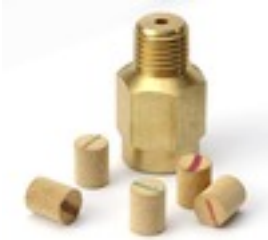
R022 - Pressure Filter Kit Filter Kit includes Snubber