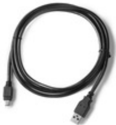
A061 - USB Download Cable USB Download Cable - length 6 feet (2m)