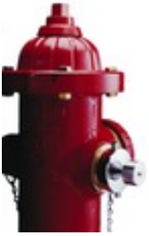
A793 - Hydrant Kit Fire Hydrant Adapter Kit