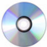
SW701 - Software DicksonWare Software Upgrade